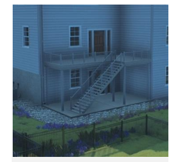
Decks attached to or built near your home provide a path for fire to reach your home. Reducing or eliminating the vulnerabilities of a deck or porch—including items on top of or underneath reduces the chance your

☐ Remove hot tubs from underneath a covered porch and from combustible (wood or composite) decks. Place hot tubs to at least 10 feet away from the home if located on a noncombustible patio material such as stones, pavers, or concrete. Ensure it includes the surrounding 5-foot noncombustible buffer and 6 vertical inches of noncombustible material such as flashing.