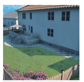
Embers blown from miles away can easily start spot fires around your home. Creating and maintaining defensible space on your property will slow the spread of fire and reduce flame intensity near vour home. By spacing out bushes and trees, you are removing ladder fuels that allow fire to spread and reducing the intensity of a fire

Note: Best practice is to place structures 30+ feet away from your home. To meet the <u>Plus</u> level designation, it is required to have all structures placed at least 30 feet from the home.