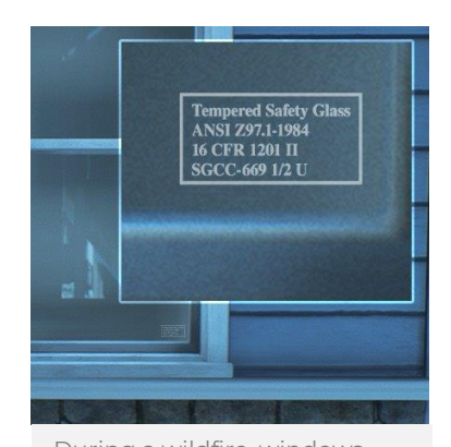
During a wildfire, windows and doors are susceptible to heat and flames. Upgrading windows and doors can help keep flames from entering and igniting materials inside the home.