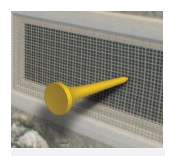
Wind-blown embers can enter your home through vents in your attic, roof, gables, and crawlspace and ignite materials inside.