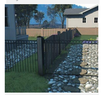
Wood and vinyl fences when ignited can provide a pathway for fire to reach your home.

noncombustible buffer zone, you significantly reduce the chances of your home being ignited by wildfire.