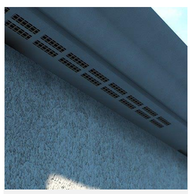
Because of their geometry, radiant heat can build up in an open eave and ignite exposed materials. Flames from nearby fuels such as a shed or vegetation can also ignite eaves.